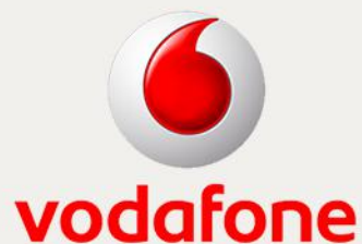
VODAFONE QATAR INNOVATION & TECHNOLOGY IN TRAVEL