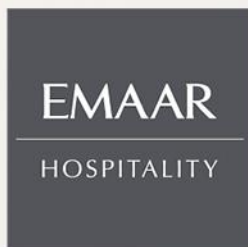
EMAAR HOSPITALITY GROUP SOCIAL MEDIA ENGAGEMENT